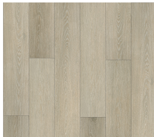
Whitehaven | ALRC00208