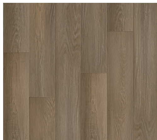
Stonebrook | ALRC0213