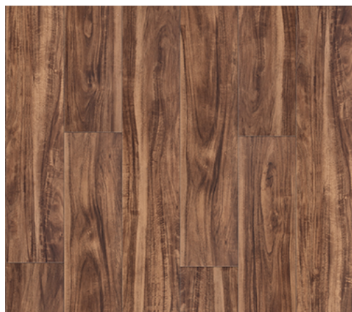
Dunford Bridge | ALRC00205