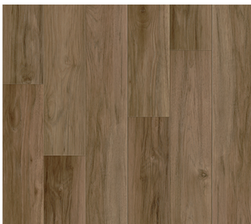
Windermere | ALRC0212