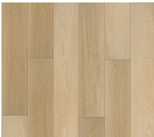
Coventry | ALRC00207