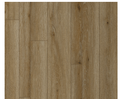
Charot | CH50101810003