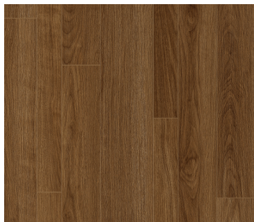
Skyway | CH50101785002