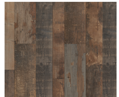
Schooner | CH5011000004