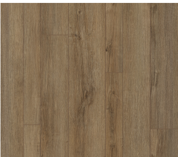
Landau | CH50101390003