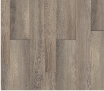
Stonehill | CH5011271007