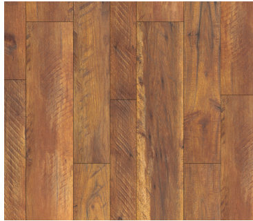
Countryside | CH5010770005