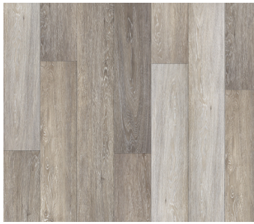
Broadmoor | CH5011193011