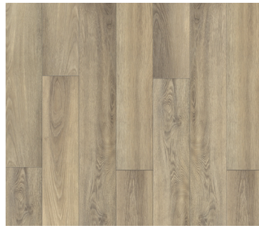
Sandstone | CH5011270008