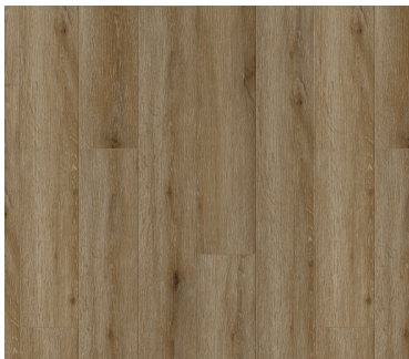
Shadow creek | CH50101768004