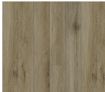
Aldarra | CH50102043002