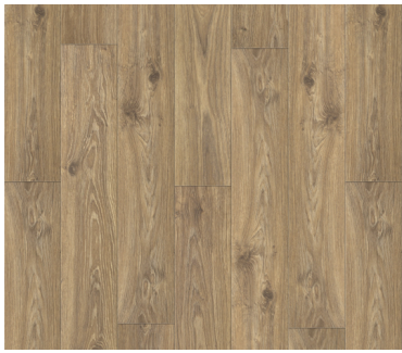
Brighton | CH5011271007