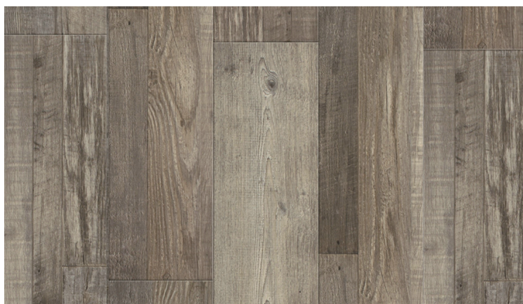
Dillon | CHCWA2240V