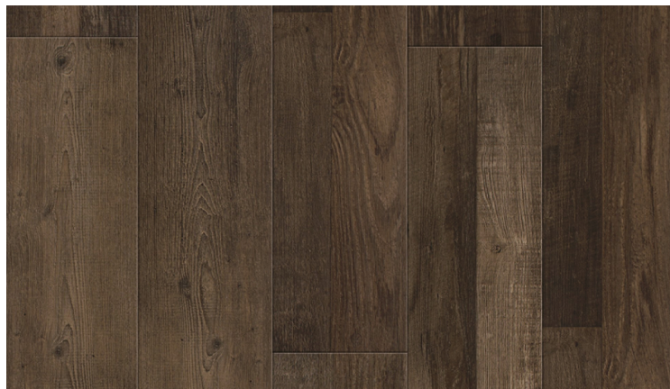
Holliday | CHCWA2242V