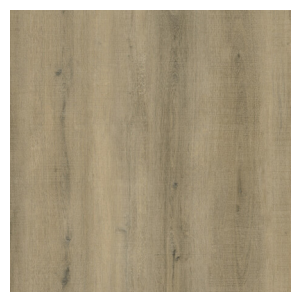
Hera | RCRC0209