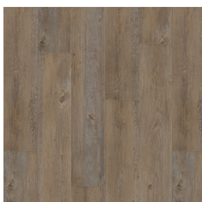
Saturn | RCRC0207