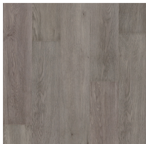
Regis | RCRC0201 *