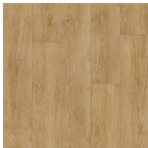
Midfield | RCRC0202