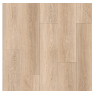
Athena | RCRC0211