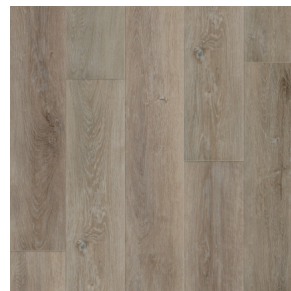
Seacliff | RCRC0204