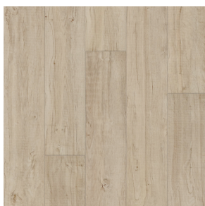
Zeus | RCRC0208 *