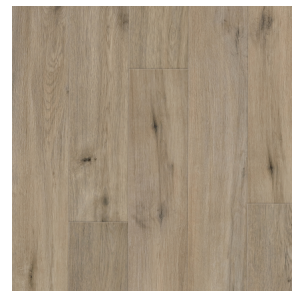
Collins | RCRC0205