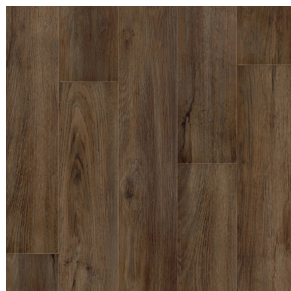
Langston | RCRC0203