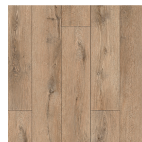
Atlas | RCRC0210