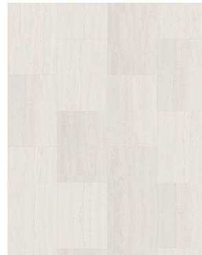
Pello Rock Natural TPWPDLO417