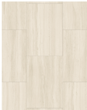
Limestone Vein Cut TPWPDLO424