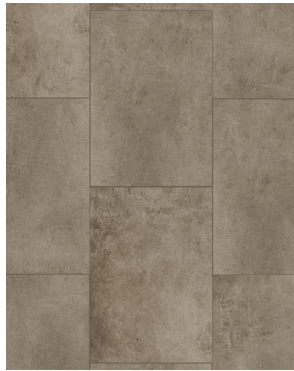
Concrete Marrone TPWPDLO422