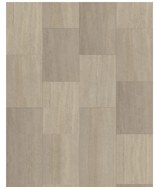
Pello Rock Sandstone TPWPDLO418

*Non-Stock Colors can be ordered through the Platforms Program.