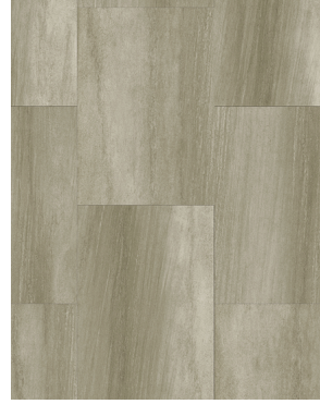
Italian Stone Crema TPWPDLO420