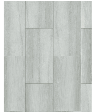
Italian Stone Grigio TPWPDLO419