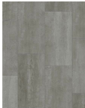
Linear Stone Grey TPWPO415 *