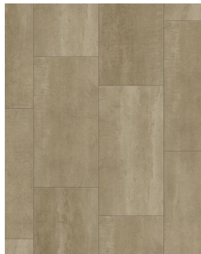
Linear Stone Beige TPWPO416 *