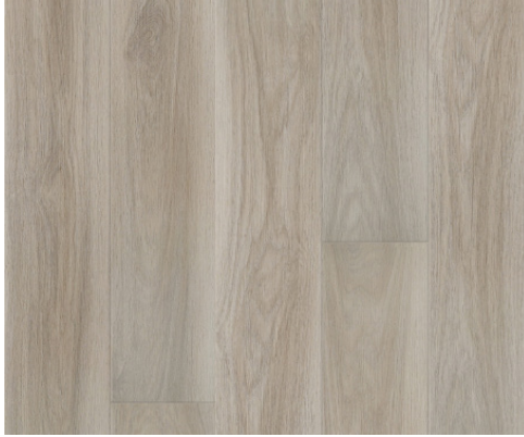
Mimosa | CTRC0102