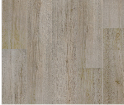
Primrose | CTRC0103