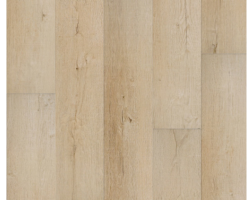
Gardenia | CTRC0106