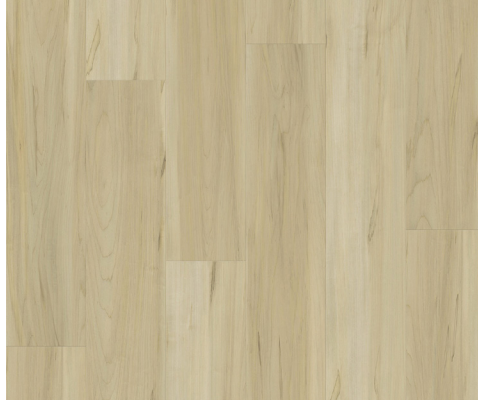
Greensboro | WIRC0402