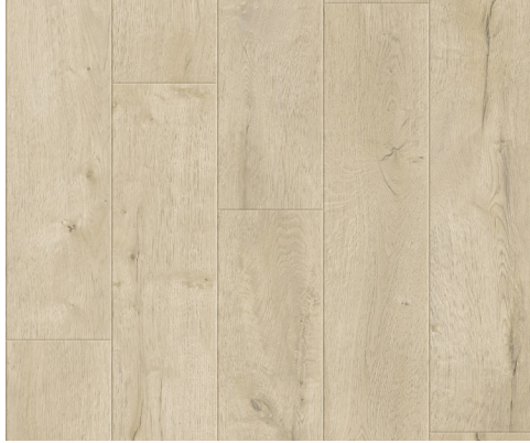
Nicholas | WIRC0401