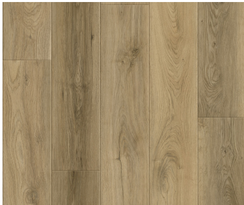
Carlsberg | WIRC0404