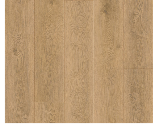
Middlebury | WIRC0403