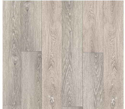
Silver Bay | NOLV0405 - (NON STOCK)