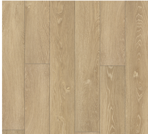
Sedona | NOLV0401 - (NON STOCK)