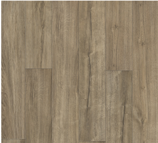
Pacific Crest | NOLV0402 - (NON STOCK)