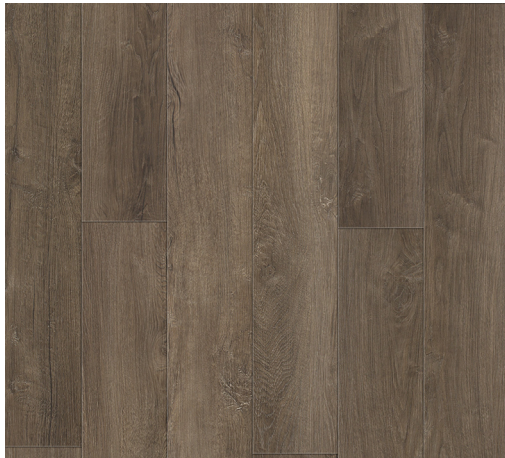
Bear Mountain | NOLV0403 (NON STOCK)