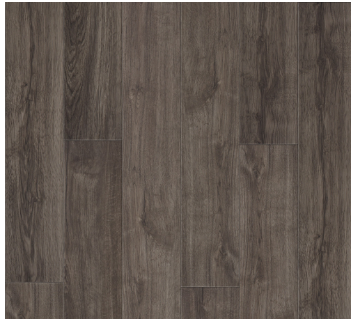
Eagle Creek | NOLV0406 - (NON STOCK)