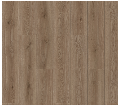
Sequoia | FXLA0605