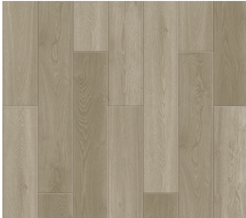
Avondale | FXLA0601