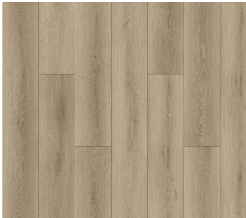
Fairwood | FXLA0604