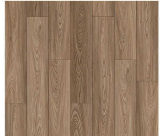
Cypress | FXLA0603