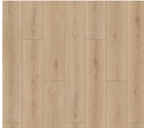
Belmont | FXLA0602