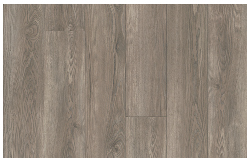
Monarch Oak* | UMLI22082