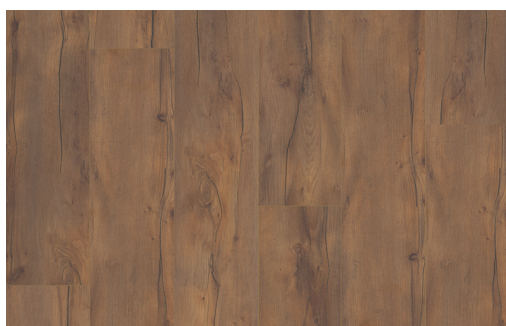
Oberlin | UM162542208