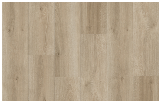
Yellowstone* | UMLI22085