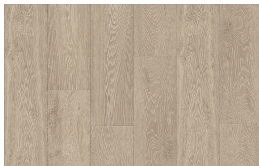
Gold Creek* | UMLI22084