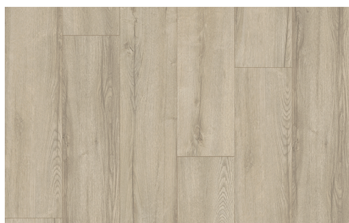
Simcoe | UM162542207