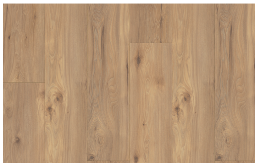
Miller Lake | UM162542204