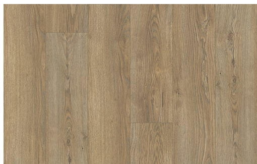
Buttermilk* | UMLI22081