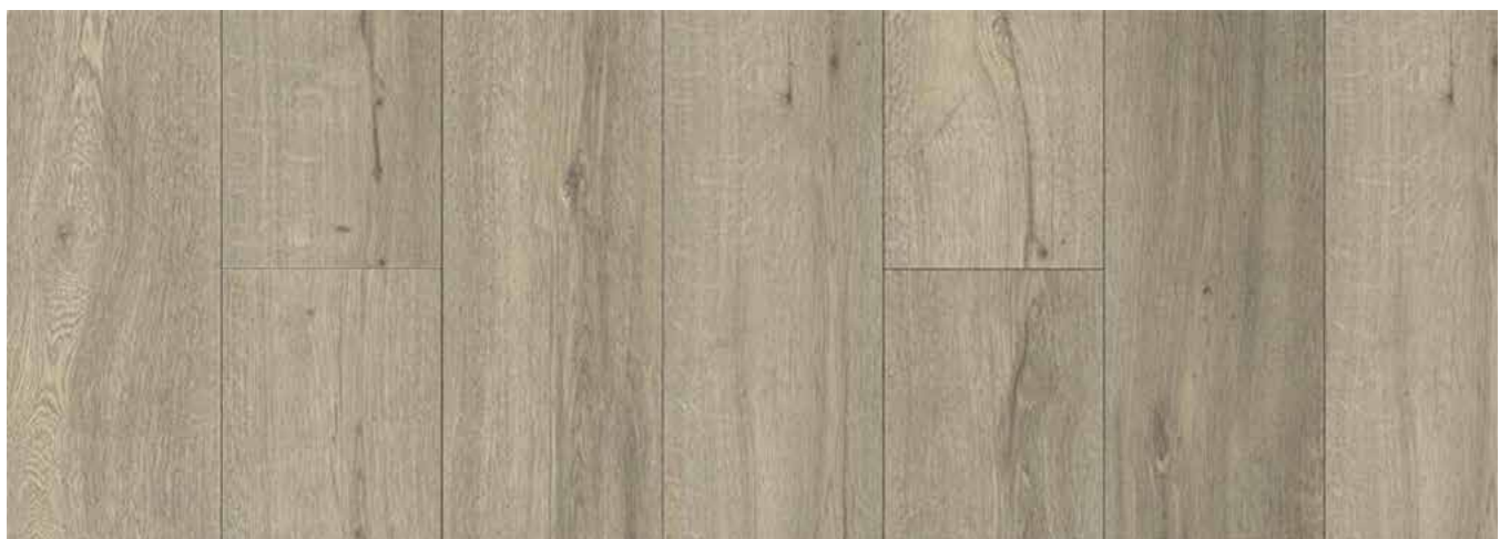
PRIMROSE SPC RIGID CORE