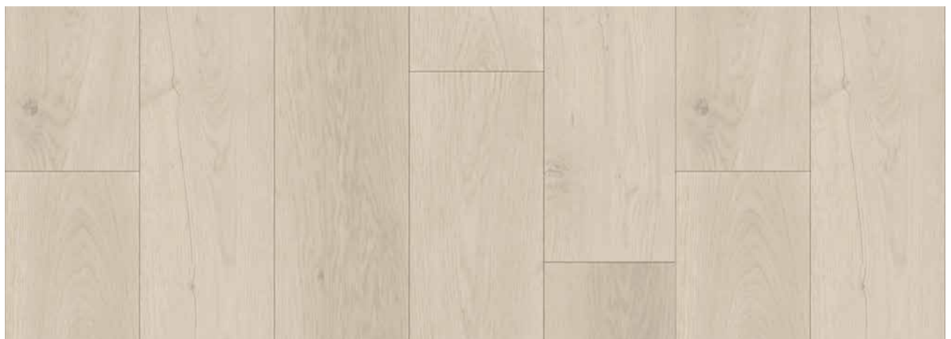
CAMELLIA SPC RIGID CORE