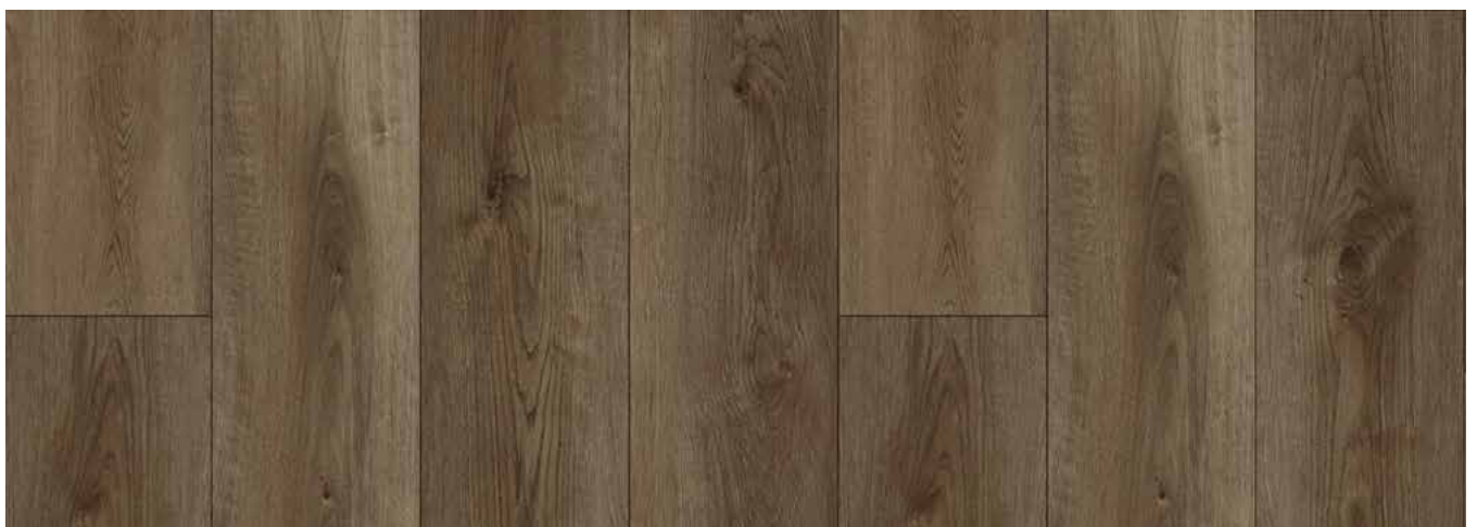
SLOOP SPC RIGID CORE