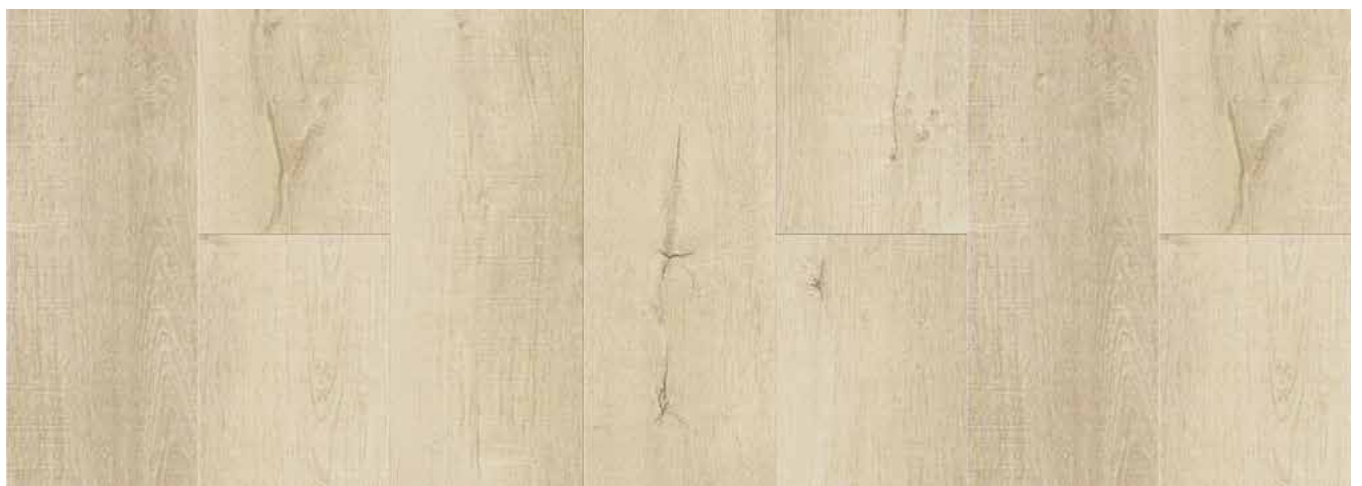
GARDENIA SPC RIGID CORE