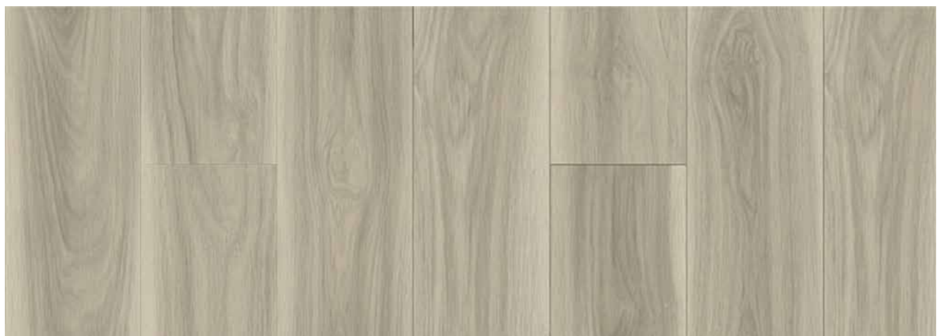
MIMOSA SPC RIGID CORE