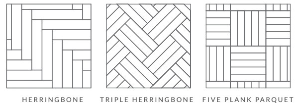
HERRINGBONE TRIPLE HERRINGBONE FIVE PLANK PARQUET