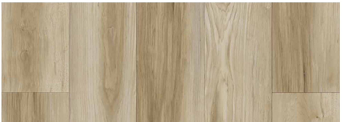
DAHLIA GLUE DOWN LV