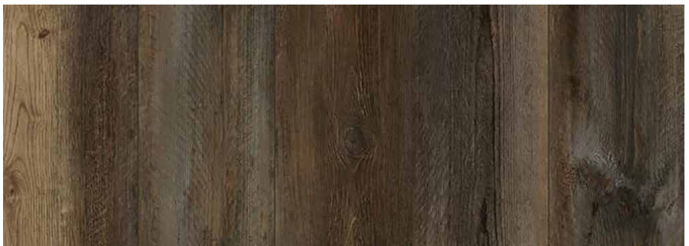
ASTER GLUE DOWN LV