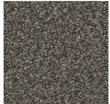
Trappers Peak | TANORTRA