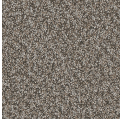
Cascade Pass | TANORCAS