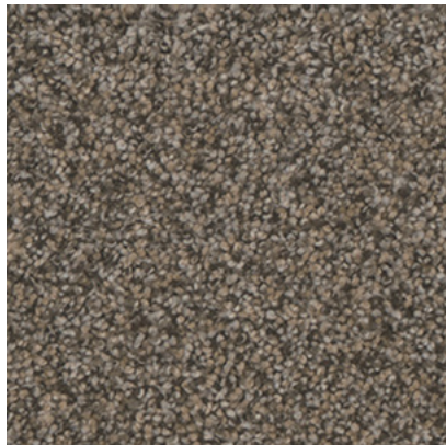
Sourdough Mountain | TANORSOU