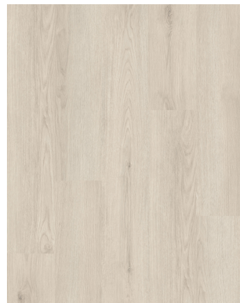
Nordic Oak TPWP0414