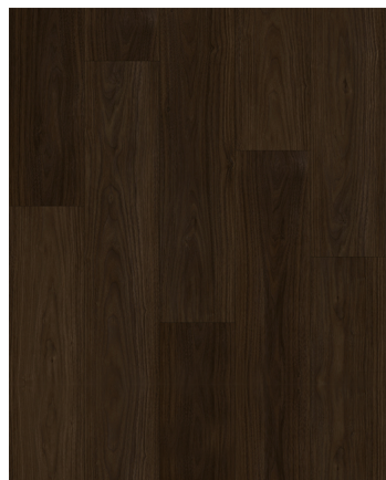
American Walnut TPWP0412