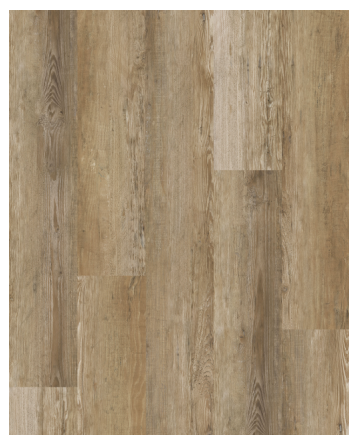
Northern Pine TPWP0404