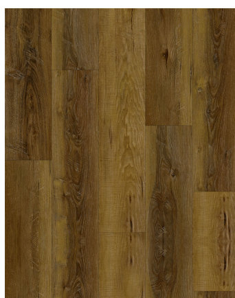
Canyon Hills TPWP0405