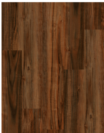
Natural Acacia TPWP0411