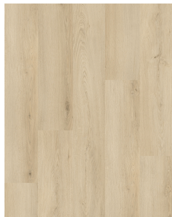
Scandinavian Oak TPWP0413