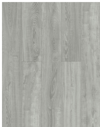
Ocean View TPWP0410