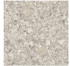
60081 | Aria Glacier 36" x 36", Drop 18", DNR