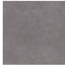
60031 | Ozart Greige 36" x 36", 18" Drop, REV