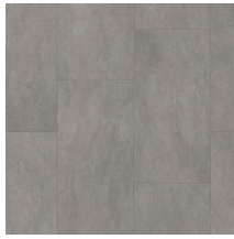
60001 | Oslo Pewter 48" x 72" DNR