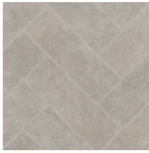
60011 | Corbin Latte 36" x 72" DNR