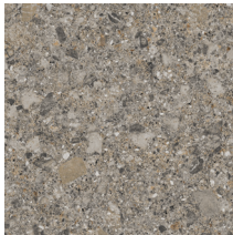
60083 | Aria Iron 36" x 36", Drop 18", DNR