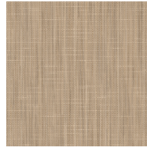
60071 | Strata Cashmere 36" x 36" DNR