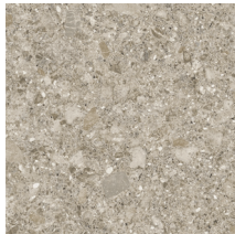
60082 | Aria Lunar 36" x 36", Drop 18", DNR