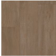
60052 | Sedwick Kobicha 36" x 72" DNR