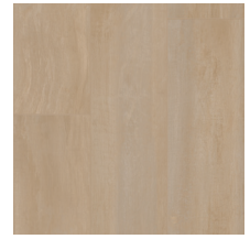
60051 | Sedwick Chai 36" x 72" DNR