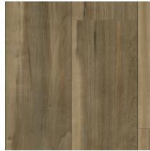
60062 | Monroe Chestnut 48" x 72", Drop 24", DNR