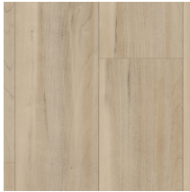
60061 | Monroe Sunkiss 48" x 72", Drop 24", DNR