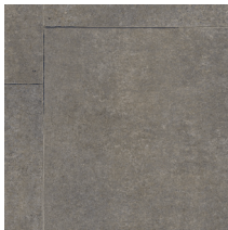
60092 | Baxton Earth 36" x 72" DNR