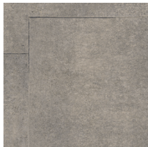
60091 | Baxton Limestone 36" x 72" DNR