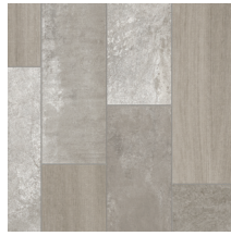
60021 | Markham Wheat 36" x 36", 18" Drop, DNR