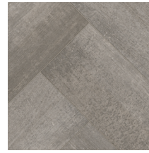
60041 | Rowell Bisque 36" x 72" DNR