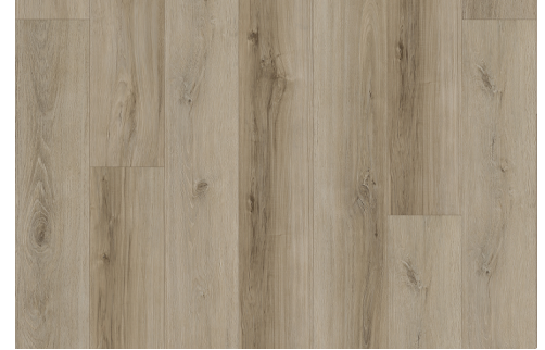
Hickory | SCRC0203