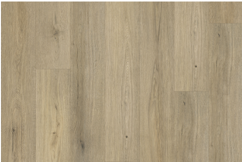
Vernessa Oak | SCRC0204