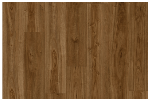
Warm Oak | SCRC0208