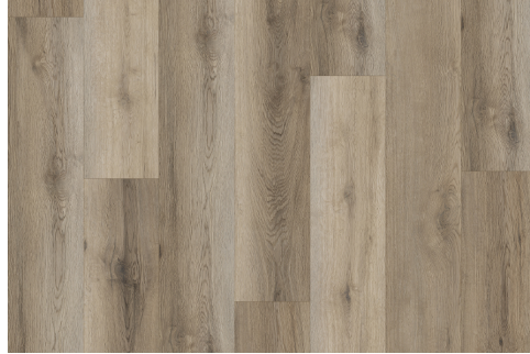
Craft Oak | SCRC0202