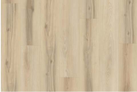
Ash | SCRC0201