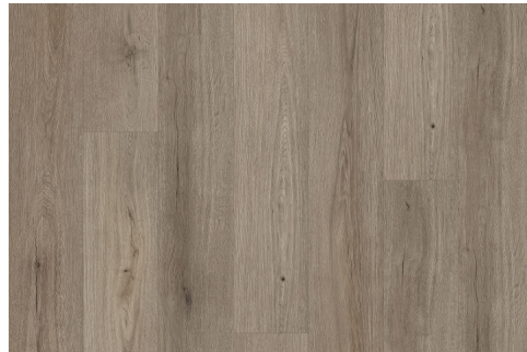
Remmy Oak | SCRC0205