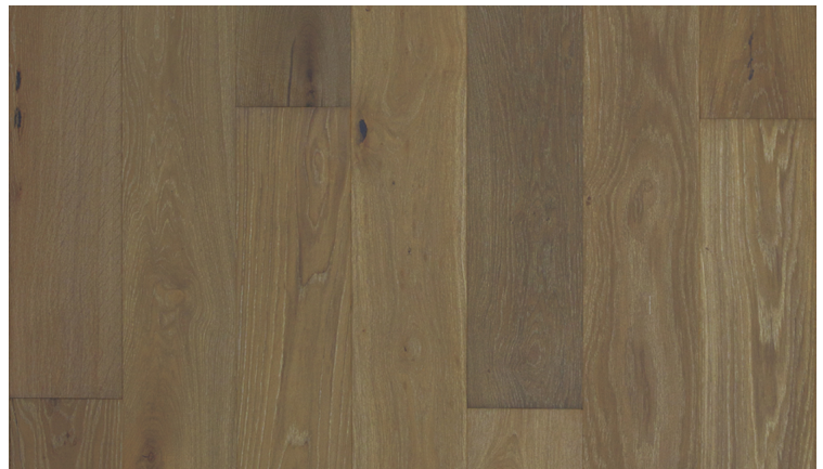
Veranda | HFAVO587VD