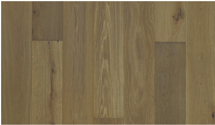
Apollo | HFAVO587AP