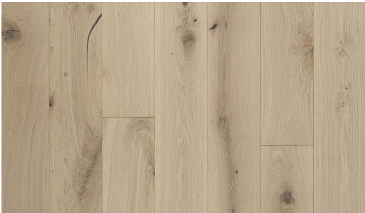
Santa Rosa | HFAVO587SR