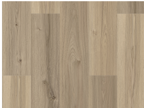
Sheridan | CTLV0502