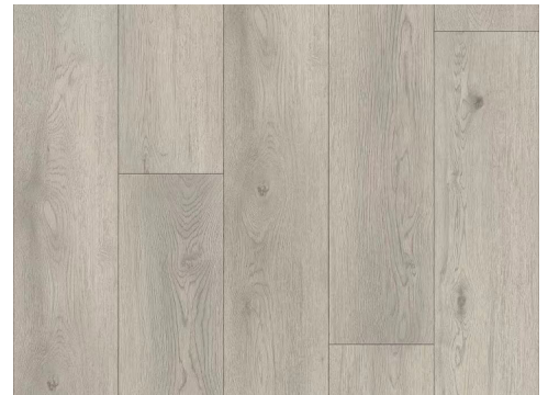
Stonebrook | CTLV0506