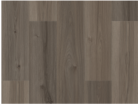
Hillside | CTLV0505