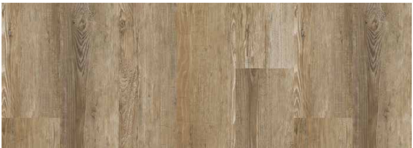
NORTHERN PINE EVC ENGINEERED VINYL CORE