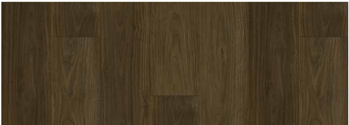
AMERICAN WALNUT EVC ENGINEERED VINYL CORE