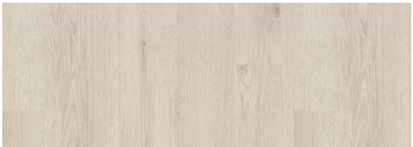
NORDIC OAK EVC ENGINEERED VINYL CORE