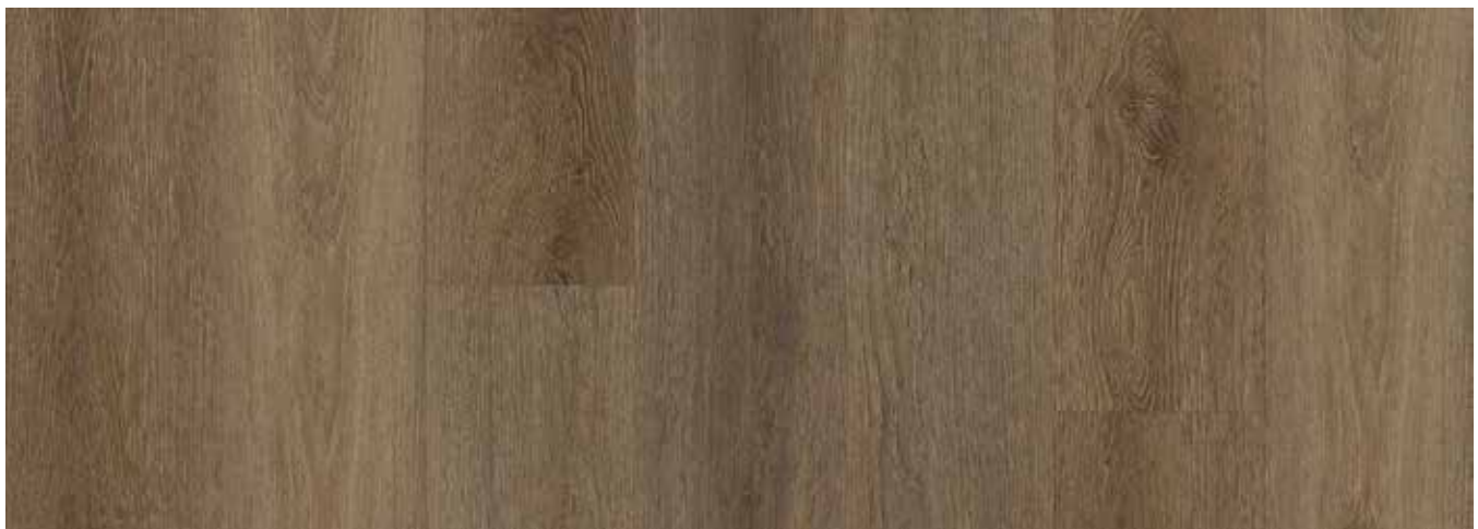
MCKENNA EVC ENGINEERED VINYL CORE