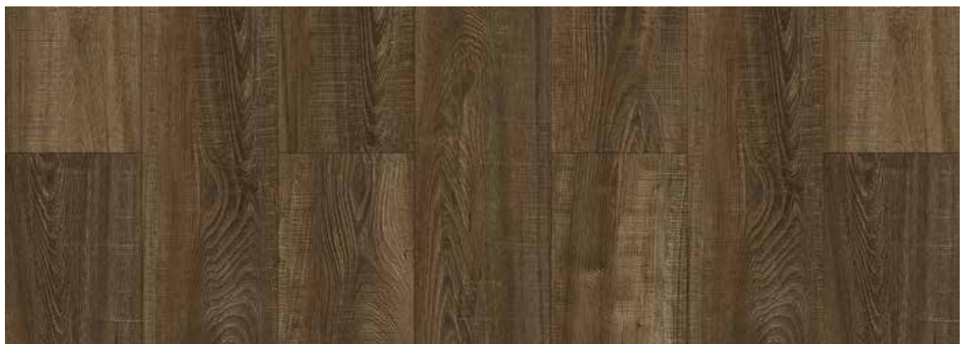
*PILCHUCK EVC ENGINEERED VINYL CORE