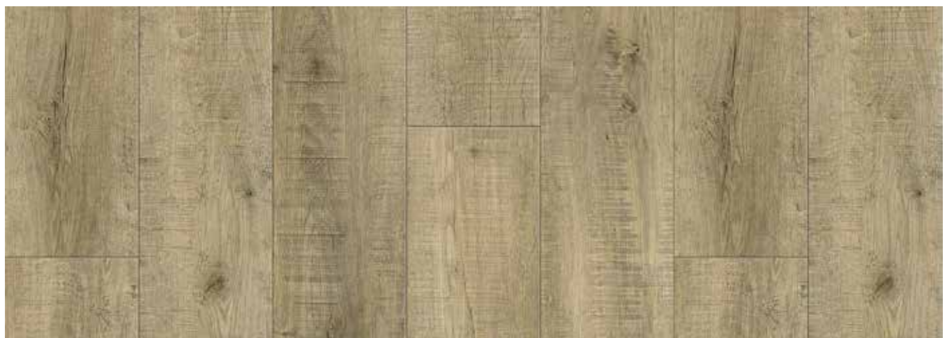
TIMBERLINE EVC ENGINEERED VINYL CORE