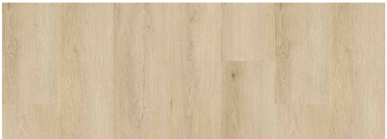
SCANDINAVIAN OAK EVC ENGINEERED VINYL CORE