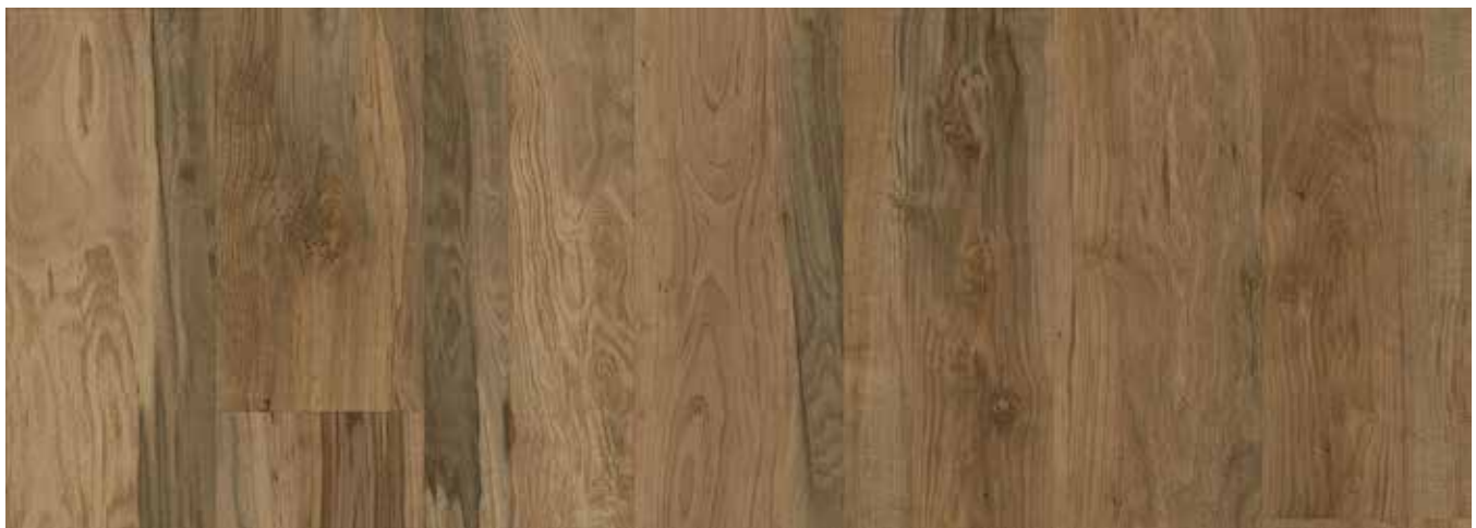
SOJOURN EVC ENGINEERED VINYL CORE