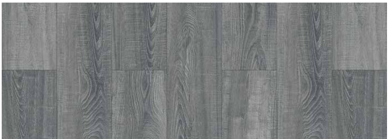
*BAYSIDE EVC ENGINEERED VINYL CORE