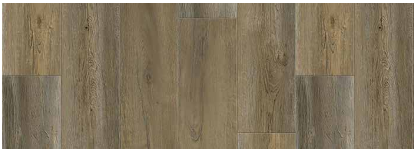
IRONWOOD EVC ENGINEERED VINYL CORE