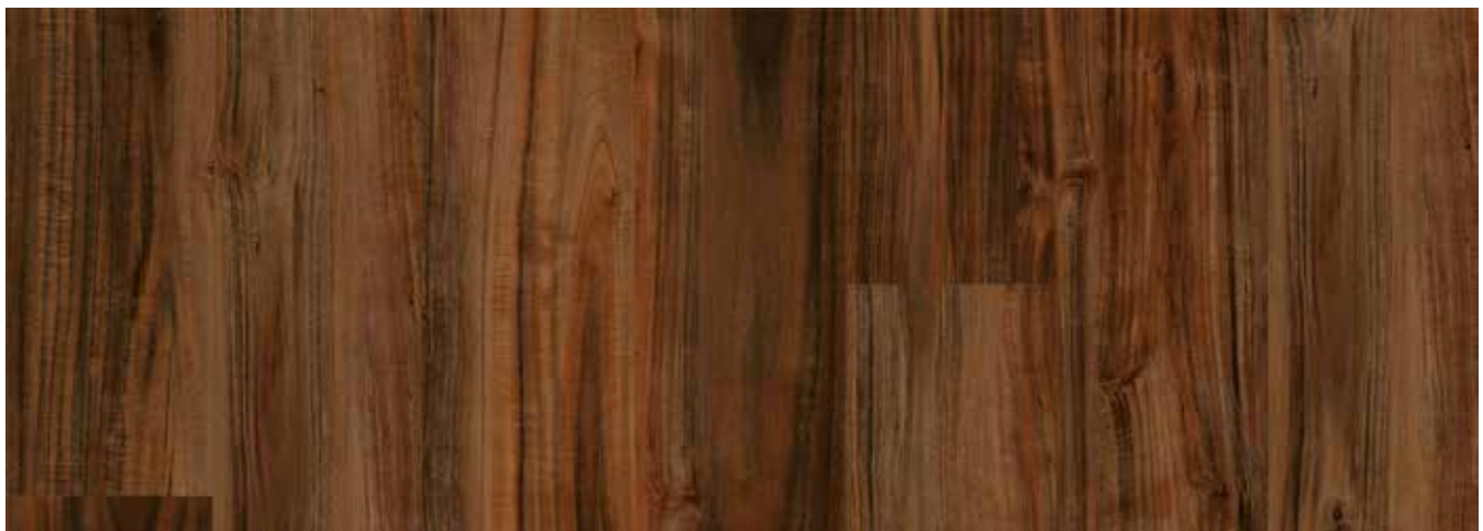
NATURAL ACACIA EVC ENGINEERED VINYL CORE