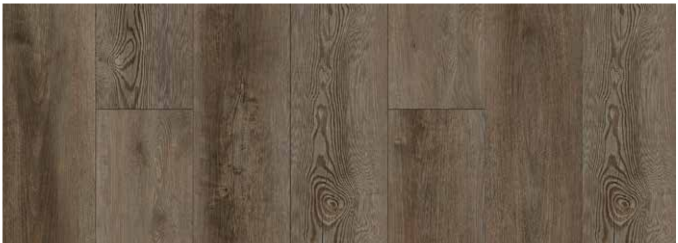
*STONEHENG EVC ENGINEERED VINYL CORE