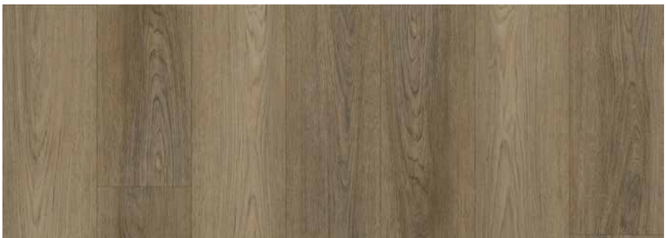
VENTURA EVC ENGINEERED VINYL CORE