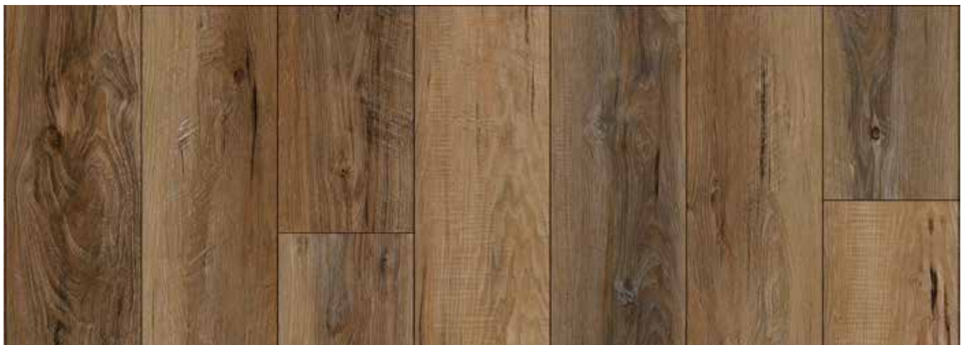
FLASK EVC ENGINEERED VINYL CORE