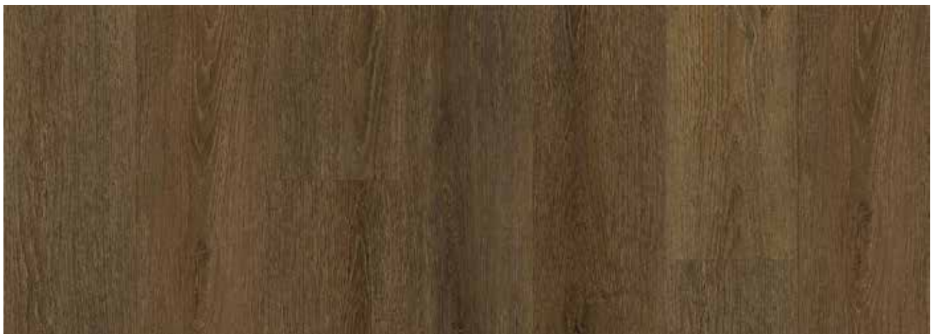
TORRANCE EVC ENGINEERED VINYL CORE