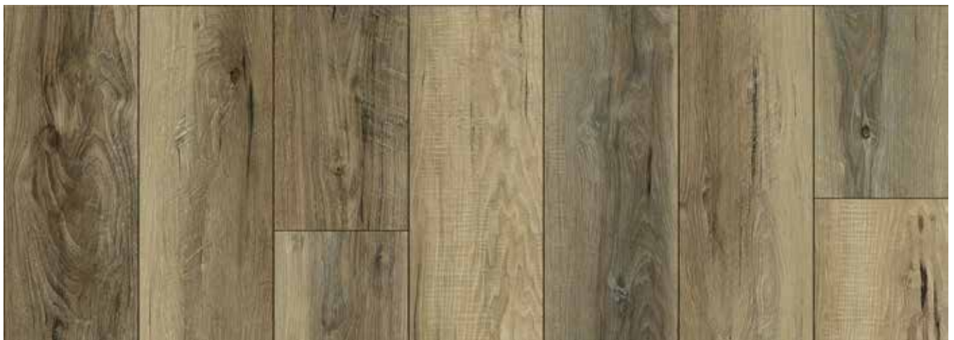
CYPRUS EVC ENGINEERED VINYL CORE