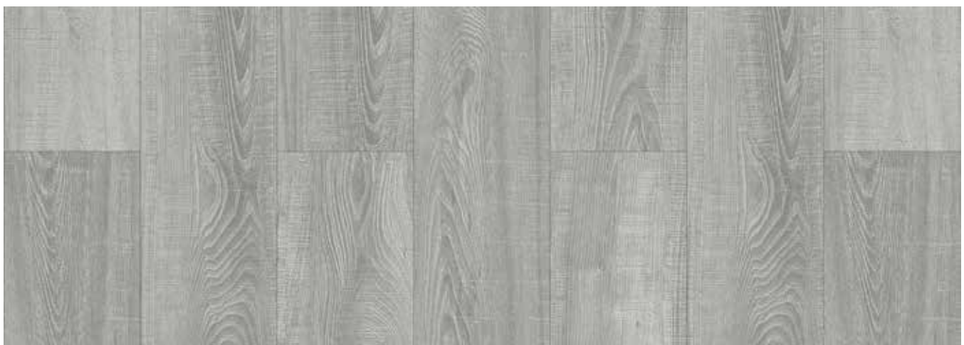
OCEAN VIEW EVC ENGINEERED VINYL CORE