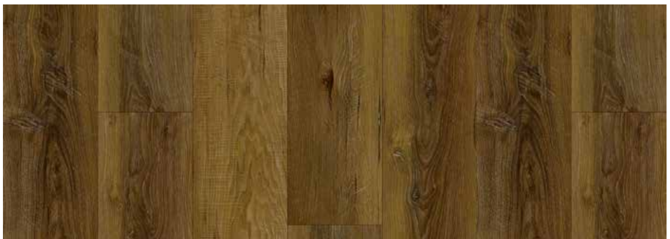
CANYON HILLS EVC ENGINEERED VINYL CORE