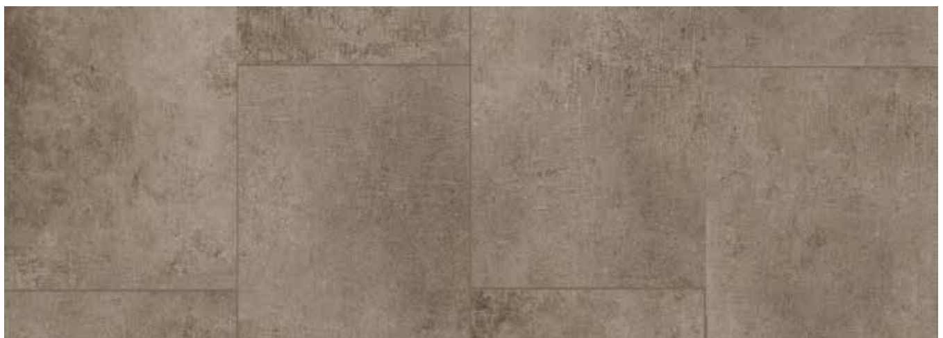
CONCRETE STAIN MARBLE EVC ENGINEERED VINYL CORE