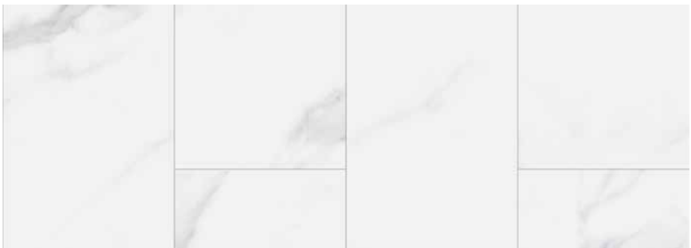
CARRARA MARBLE EVC ENGINEERED VINYL CORE