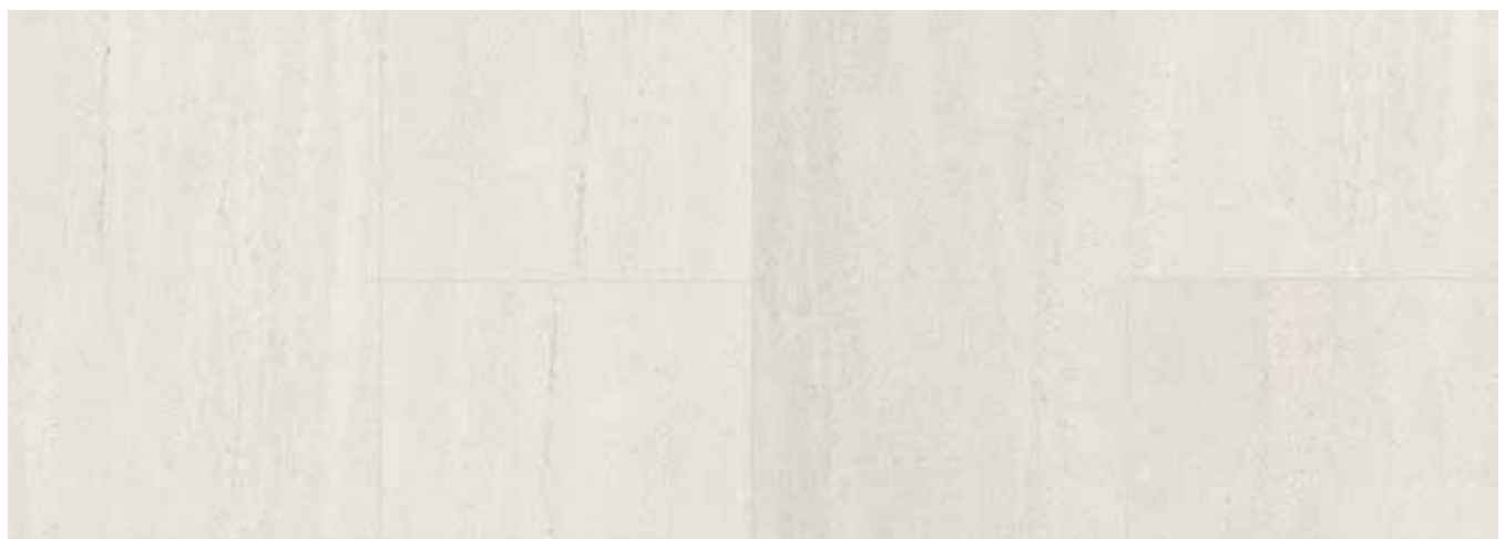
PELLO ROCK NATURAL EVC ENGINEERED VINYL CORE