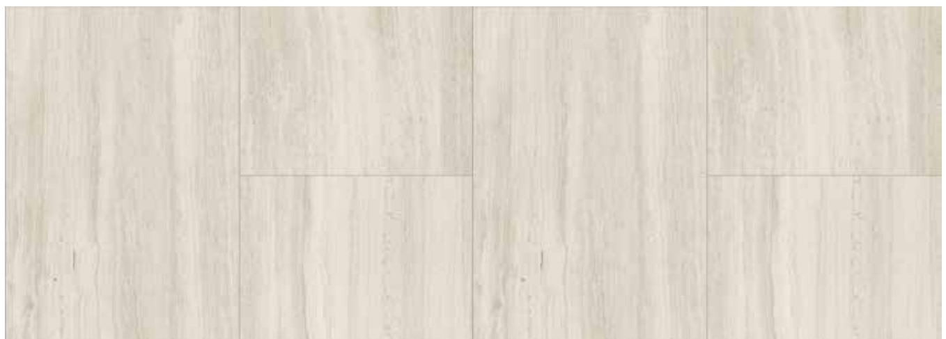
LIMESTONE VEIN CUT EVC ENGINEERED VINYL CORE