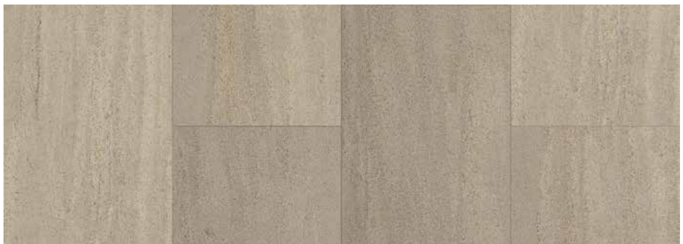
PELLO ROCK SANDSTONE EVC ENGINEERED VINYL CORE