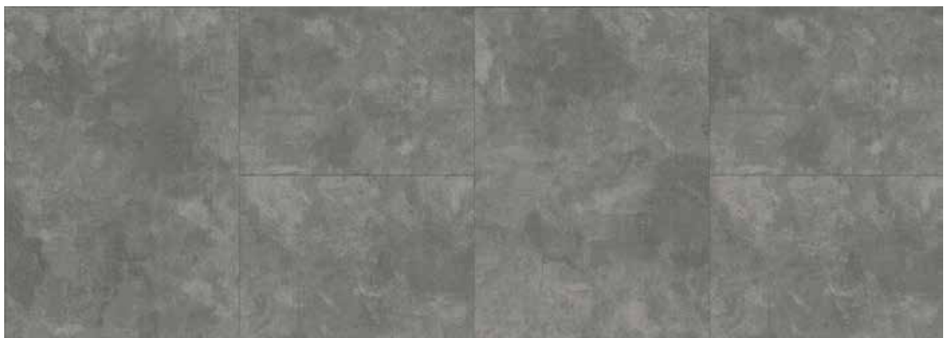
CONCRETE STAIN NATURELLE EVC ENGINEERED VINYL CORE