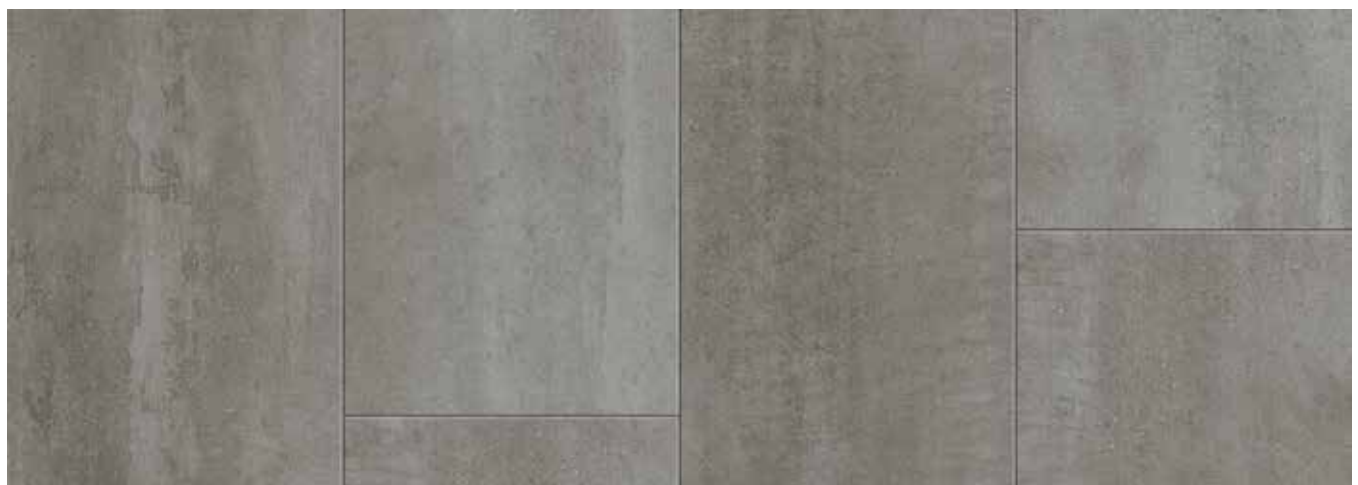
*LINEAR STONE GREY EVC ENGINEERED VINYL CORE