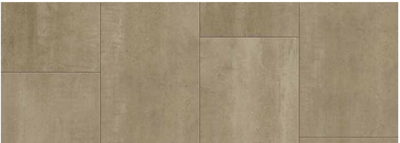
*LINEAR STONE BEIGE EVC ENGINEERED VINYL CORE