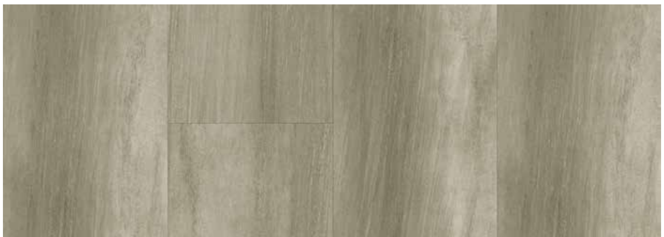
ITALIAN STONE CREMA EVC ENGINEERED VINYL CORE