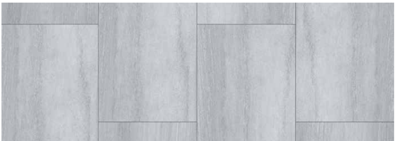
ITALIAN STONE GRIGIO EVC ENGINEERED VINYL CORE