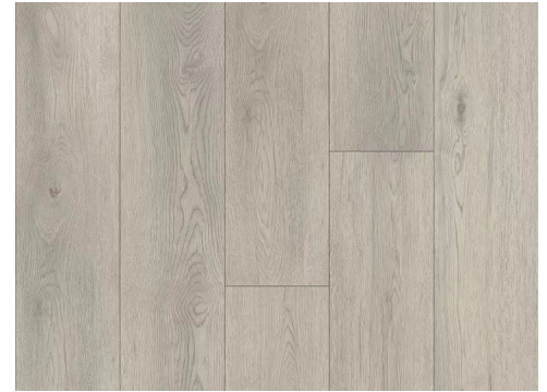
Granville | CTLV0406