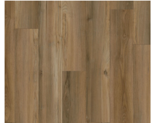
Porter Hickory | WIRC0503