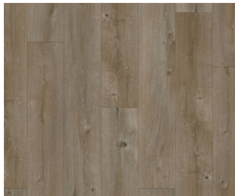
Yebinna Oak | WIRC0505