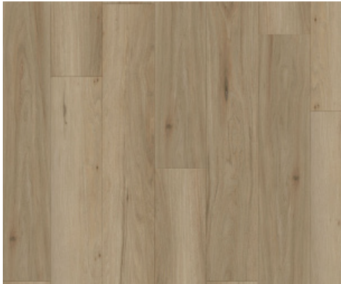
Tanunda Hickory | WIRC0501