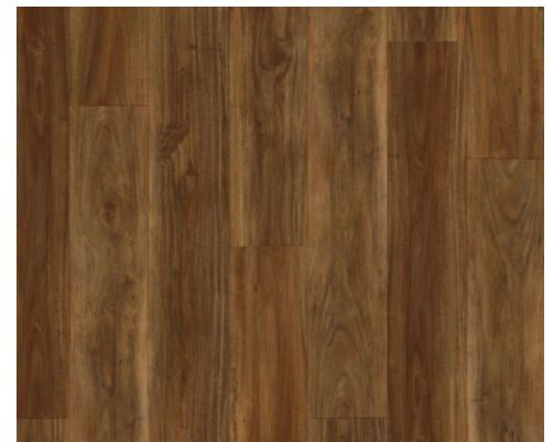
Calla Acacia | WIRC0506