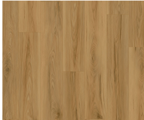
Lager Hickory | WIRC0502